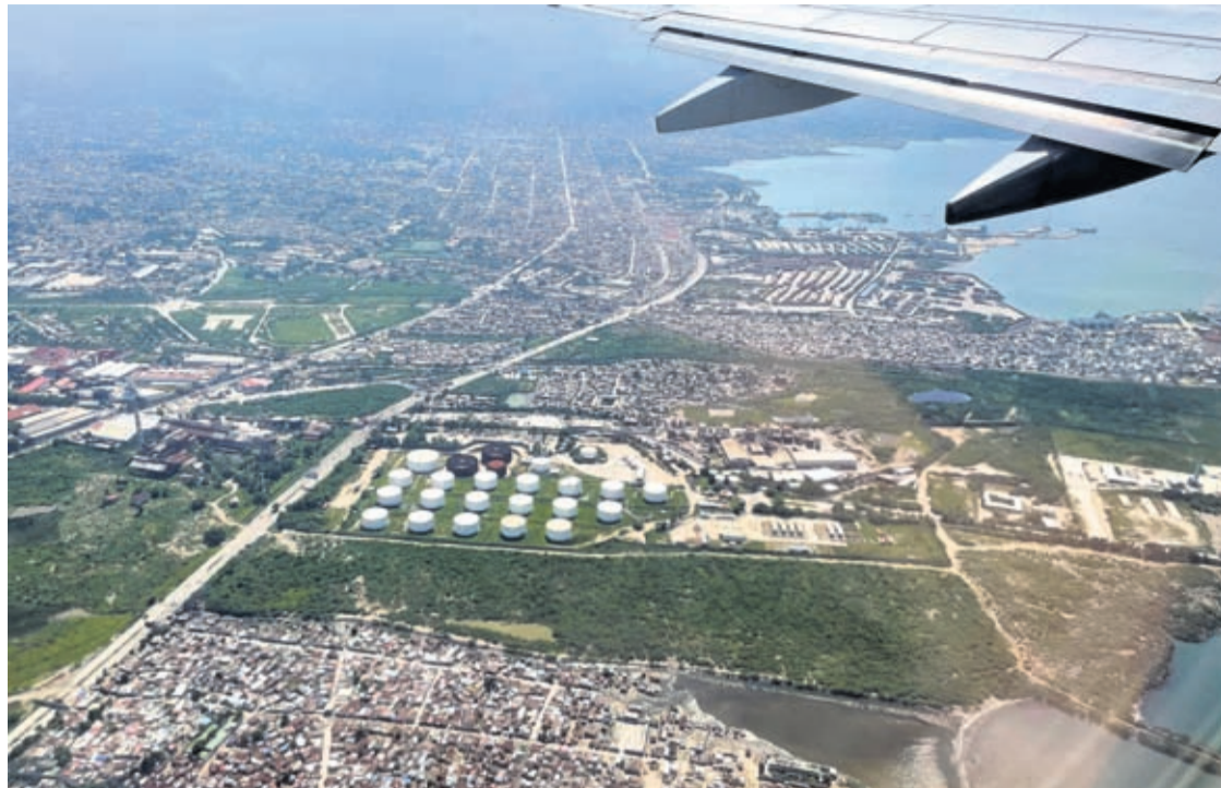
A fuel terminal is seen from a plane in Port-au-Prince, Haiti, Friday, Nov. 4, 2022. Haiti's National Police has been fighting to remove a powerful gang that surrounded the key fuel terminal in Port-au-Prince for almost two months though it's not immediately clear if the blockade has been fully lifted.

access to about 10 millions gallons of diesel and gasoline and more than 800,000 gallons of kerosene, forcing gas stations to close, hospitals to cut back on critical services and banks and grocery stores to operate on a limited schedule.